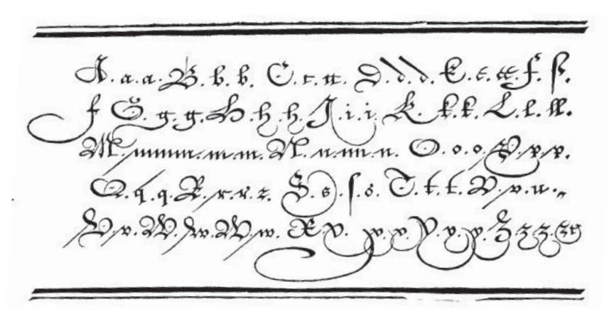
Fig. 4. William Comley's A New Copy-Booke of All the Most Vsuall English Hands, image 4 (n.p.). Detail.

majuscule D is open and consists of a single stroke, a concave curve followed by a rounded bowl; majuscule 'H' resembles a loopy majuscule 'L' with a loop attached to the right (though this loop does not quite form a backwards S, as in fig. 2); majuscule T is formed with two successive, connected halfcircles; and the initial and terminal ascenders of majuscule W bend to the left, a choice which is strongly favoured in Newdigate's earlier, rather than later, hand. Furthermore the typical presence of a series of dots throughout Comley's models, as well as others, may evince a source for the dots in the bowls of majuscules O, B, P, and V which occur in both Arbury and Osborne versions of The Humorous Magistrate — these dots appear in Comley's A New Copy-Booke, as well as in his A New Alphabet of the Capitall Romane Knotted Letters. 76 Learners were meant to practice these letter forms, and even to 'go over them with a dry pen, to acquaint their hand with their shape',77 an example of which is evident in Plate 1, a draft letter in which Newdigate practices both individual Italic letter forms (such as p) and entire phrases in the margins of the letter. This letter suggests that Newdigate was interested in perfecting his scribal hand, writing and rewriting forms to his satisfaction.<sup>78</sup> Newdigate may have used a manual such as Comley's to practice his writing, adopting the detailed conventions established therein and even incorporating the dots into his figures.