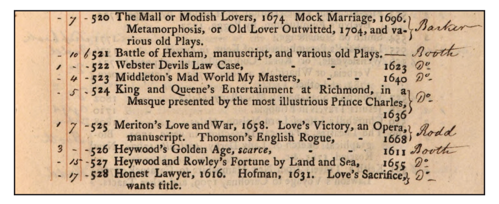
Figure 3. A Catalogue of the Curious and Extensive Library, of the Late John North, Esq.... Part the Third (London, 1819), 21.

To summarize: identifying Barker as the buyer of the 'Battle of Hexham in manuscript ' at the 1807 Reed sale, noticing the absence of a play by that title attributed to Barnabe Barnes in Barker's 1814 list The Drama Recorded as well as in the 1812 edition of Biographia Dramatica , and finding no attribution to Barnes in the 1819 North catalogue all gives us ample reason to doubt that the manuscript sold in 1807 was, in fact, by Barnes. Taken as a whole, no reliable evidence survives that Barnabe Barnes ever wrote a play called The Battle of Hexham .